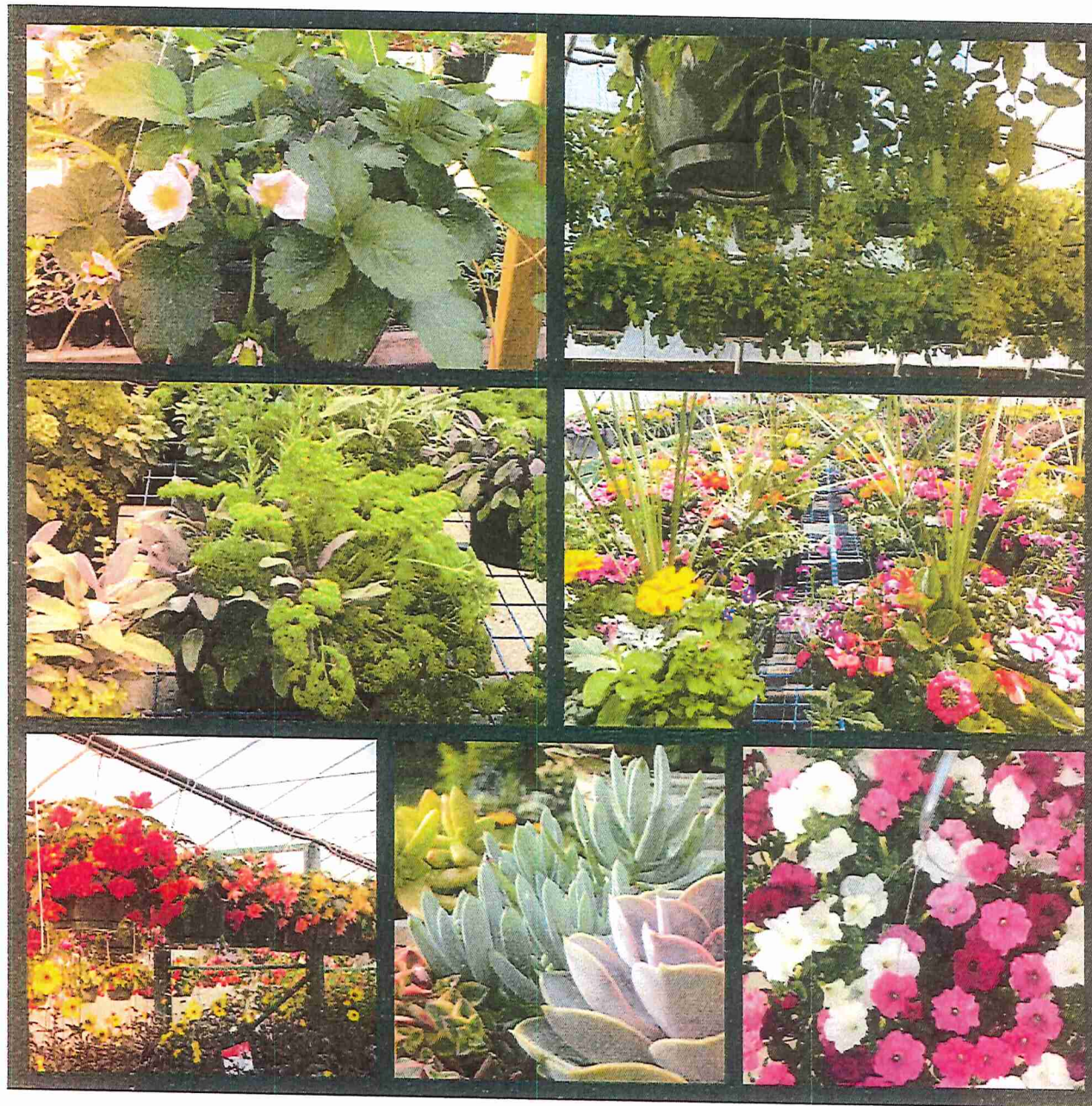
Fundraiser items, from clockwise left corner: 12" Strawberry Basket, 12" Tomato Basket, 16" Herb Oval, 12" Mixed Planter, 12" Mixed Begonias, 8" Succulents (better representation below), 12" Trailing Petunia (see more below)